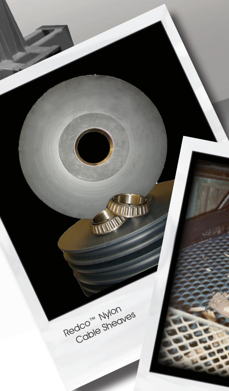
Redco™ Nylon Cable Sheaves