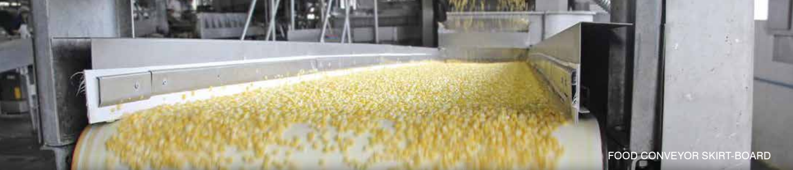
FOOD CONVEYOR SKIRT-BOARD