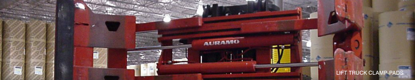
LIFT TRUCK CLAMP-PADS