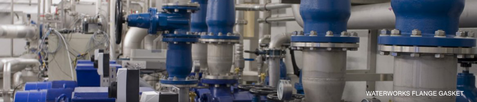
WATERWORKS FLANGE GASKET